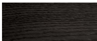
rovere spazzolato Liquorice Liquorice brushed oak