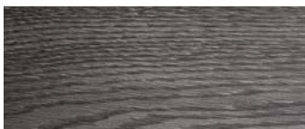
rovere spazzolato Charcoal Charcoal brushed oak